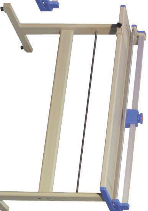
PRO STAND LAMITRIM