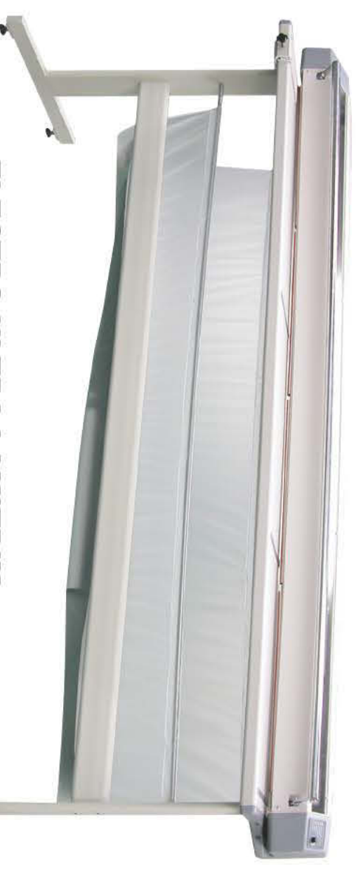
ELECTRO ULTRA LAMITRIM